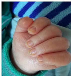
Figure.4: Improvement of paronychia and ungual dystrophy of fingernails after zinc supplementation and ciclopirox topical solution